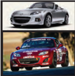
Donor or Existing NC Gen (2006 - 2015) Mazda MX-5