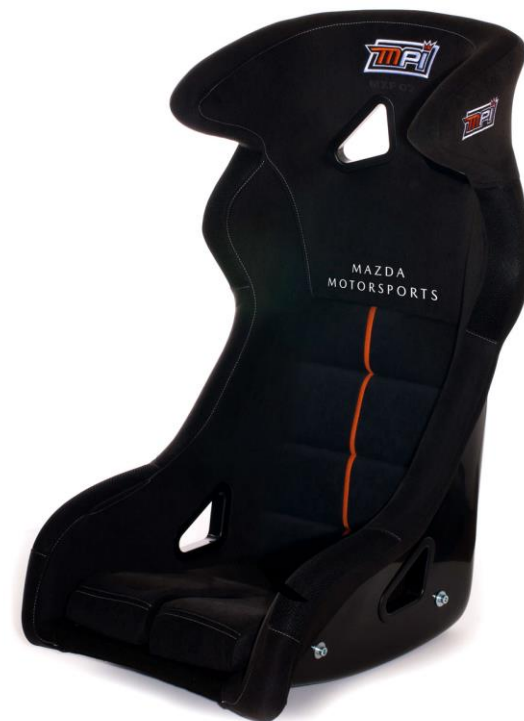
HALO RACING SEAT