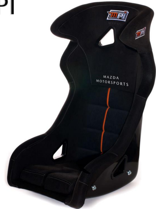
HALO RACING SEAT