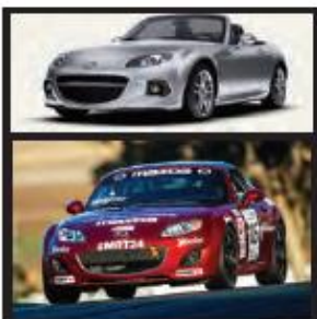
Donor or Existing NC Gen (2006 - 2015) Mazda MX-5