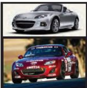
Donor or Existing NC Gen (2006 - 2015) Mazda MX-5