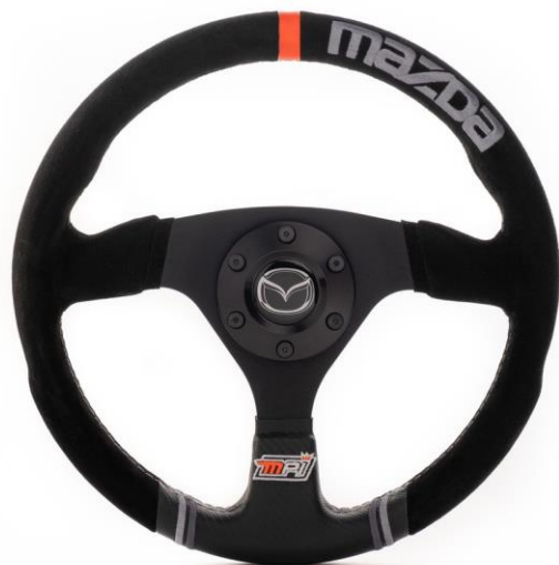
STEERING WHEEL BY MPI