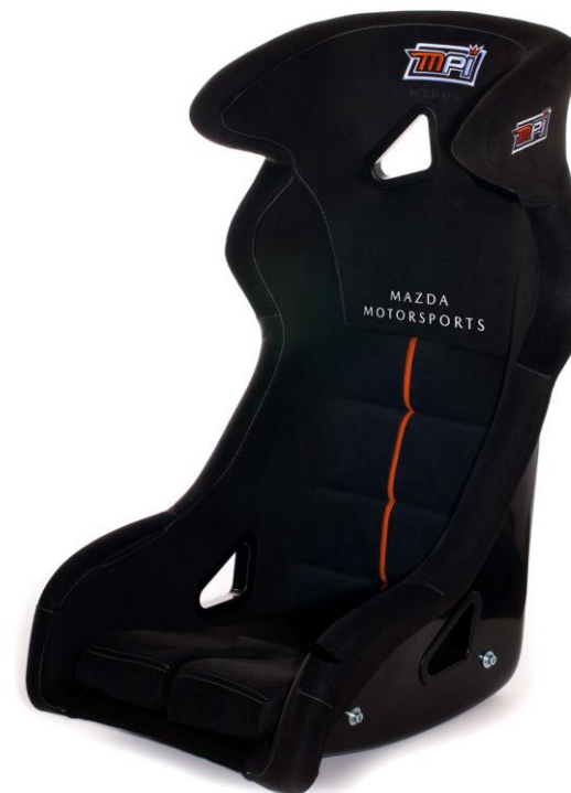
HALO RACING SEAT BY MPI

LOOK ABOVE NOT YET AVAILABLE (SLIGHT CHANGES TO DESIGN)