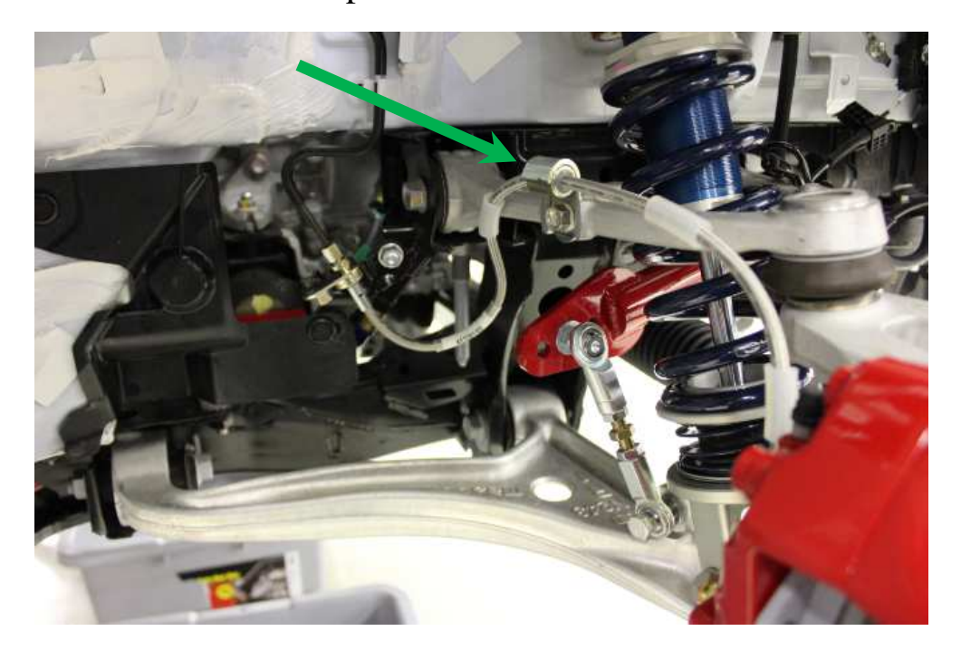
Figure 2 . Brake Line Mounted on Top of Control Arm. ← Proper brake hose mounting

The brake line routing should be mounted on the <u>top side</u> of the control arm as shown in figure 2. If your front brake lines are mounted as shown in figure 1 (on the bottom of the upper control arm), please remove the retaining bolt, rotate the brake line locating bracket as shown in figure two. Then place a small amount of blue Loctite on the bolt, replace it into the upper control arm and torque the bolt to 13.8 - 18.8 ft pounds