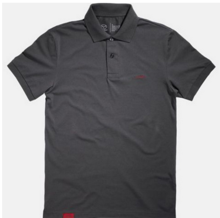
Men's MX-5 Cup Embroidered-Logo Pique Polo

Description: Two of the greatest names in motorsports have joined forces to create Mazda Team Joest. Together, they are creating the next generation of prototype racing development with the RT24-P, which draws the strength of Japanese, American and German development teams to create one of the most beautifully striking racecars of all time. Long sleeve tee, 4.3 oz 60% combed ring spun cotton, 40% polyester, signature Mazda Motorsports red label on the hip.