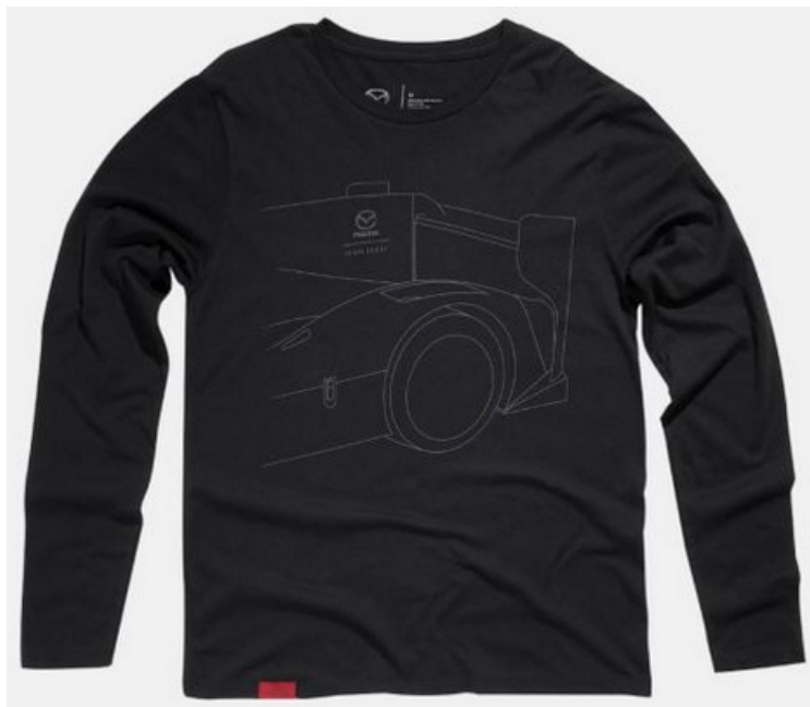
Men's Mazda Team Joest RT24-P Contour Print Long Sleeve T-Shirt (2018 Race Schedule Printed on Back)

Contingency Points Required to Purchase: One (1)